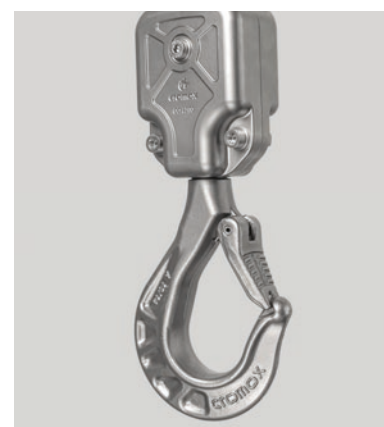
Fig.: CCH-200, versions vary

cromox ® products are developed and manufactured by Ketten Wälde GmbH, headquartered in Germany.